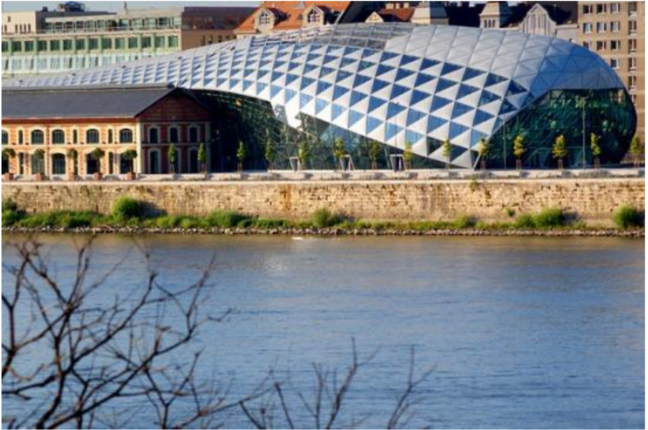
Venue of the tournament Balna Budapest